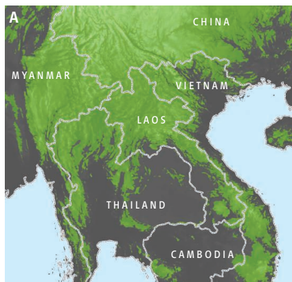
Swidden versus rubber. (A) Montane mainland Southeast Asia (green shaded areas) is defined here as the lands between 300 and 3000 m above sea level. (B) Most swidden fields and fallows on slopes near villages and roads in this area in Xishuangbanna have been converted to terraced rubber stands.

The conversion of both primary and secondary forests to rubber threatens biodiversity and may result in reduced total carbon biomass (3–5). Negative hydrological consequences are also of concern—for example, in the Xishuangbanna prefecture of Yunnan province, China—but current data are too sparse to quantify the extent of the impacts (3, 6). The effect of conversion to rubber on catchment or regional hydrology depends, in part, on the water use of rubber versus that of the original displaced vegetation. Another factor is the degree to which rainwater infiltration